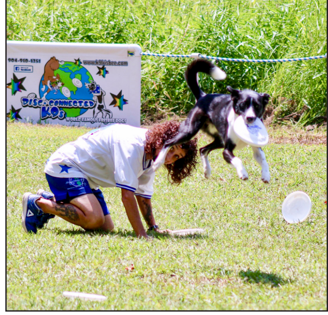
The super talented Disc-Connected K9s performed multiple shows at the Georgia Mountain Fair this year.