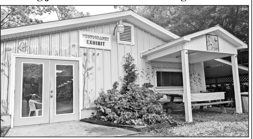
Photography Exhibit/Garden Club at the Georgia Mountain Fairgrounds