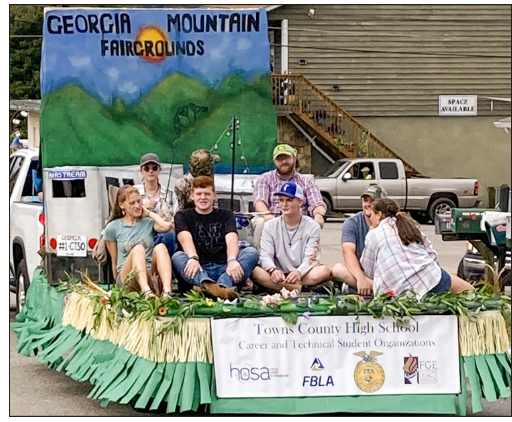
Towns County High School CTSO Float in the Georgia Mountain Fair Parade

The Georgia Mountain Fair Parade is a beloved local tradition, and Towns County High School is always proud to support the event. What made the day even better, besides the somewhat cooler weather and the camaraderie of the other parade participants, was the first-place ribbon won by Towns County High School's Career and Technical Student Organizations (CTSOs).