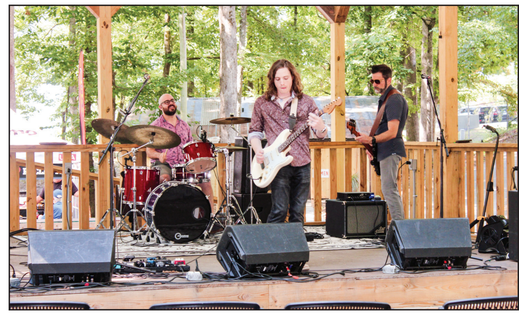
Live music plays an integral role in the Georgia Mountain Fair each year, connected to the porch-pickin' roots of the area.

The ball field will serve as the grounds to see bucking broncos and bulls bested by world class champions hailing from across the United States